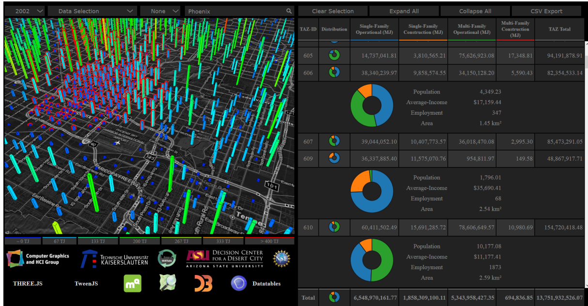
Figure 1: Screenshot of the WebGL geovisualization case study. The application consists of two main windows: the 3D rendering (left) and the table visualization (right).