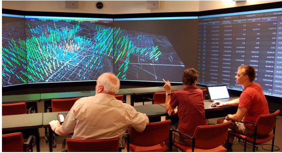
Figure 3: Demo of our energy visualization in the Decision Theater at Arizona State University

application to process input from these devices, it is possible to visualize user input on the main screen, thus enabling multi-user interaction.